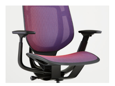
Patented Hybrid Seat

A weight-activated mechanism responds automatically to your body as you sit and change postures in every direction.