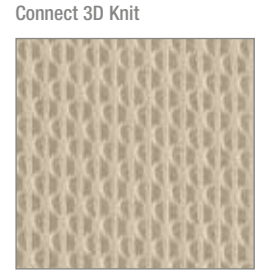
Color match available for all Cogent: Connect color options